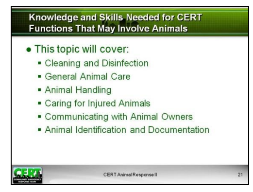
Display Slide 21

Encourage participants to refer back to CERT Basic Training Unit 7 on Disaster Psychology.