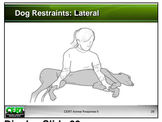
Display Slide 29