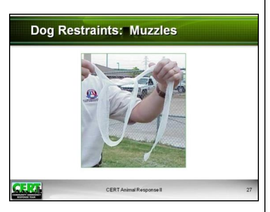
Display Slide 27