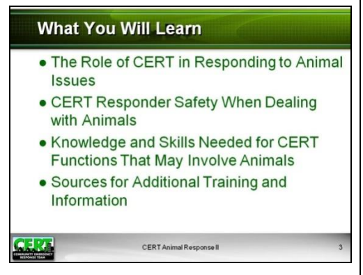
Display Slide 3