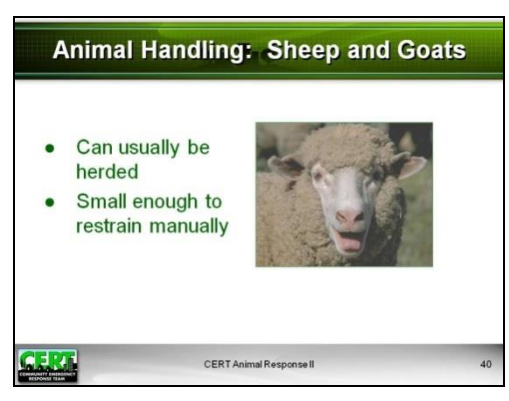
Display Slide 40