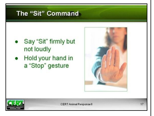
Display Slide 17