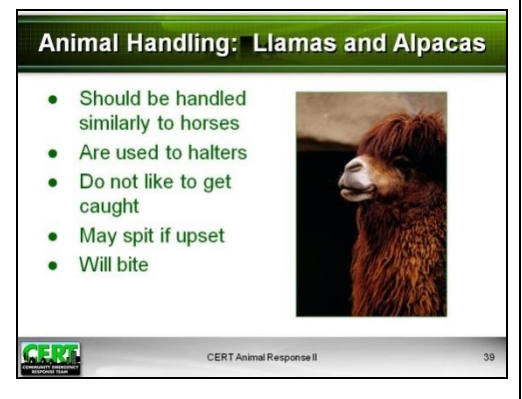
Display Slide 39